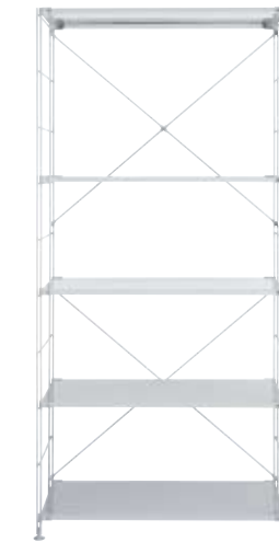
SUS STEEL SHELVING UNIT