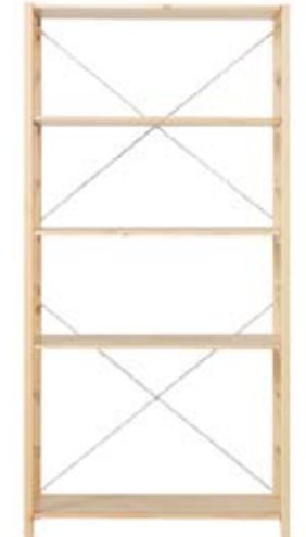
PINEWOOD SHELVING UNIT